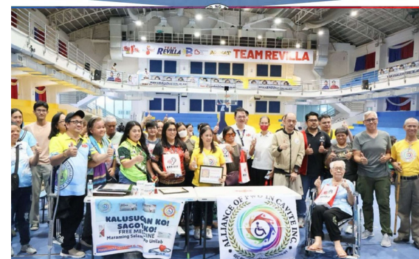
Bacoor City, May 5, 2025 - Mayor Strike B. Revilla today hosted a meet and greet with the Barangay Nutrition Scholars (BNS) of Bacoor City at the Strike Gymnasium. The event, organized by the City Government of Bacoor, brought together the BNS from all 47 barangays, led by President Daryl Agno.