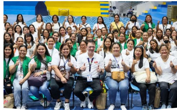
Bacoor City, May 5, 2025 - Mayor Strike B. Revilla today hosted a meet and greet with the Barangay Nutrition Scholars (BNS) of Bacoor City at the Strike Gymnasium. The event, organized by the City Government of Bacoor, brought together the BNS from all 47 barangays, led by President Daryl Agno.

The purpose of the gathering was to strengthen the collaboration between the City Government and the BNS in promoting the health and well-being of Bacooreños. Mayor Strike B. Revilla expressed his appreciation for the BNS's dedication and hard work in promoting nutrition and health awareness within their communities. The meet and greet provided an opportunity for the BNS to share their experiences, discuss challenges, and explore strategies for enhancing their programs. It also served as a platform for the City Government to provide support and guidance to the BNS in their efforts to improve the health and nutritional status of Bacooreños. The event signifies the City Government's commitment to working hand-in-hand with community health workers to create a healthier and more vibrant Bacoor.