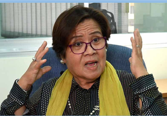
Turn on page 2