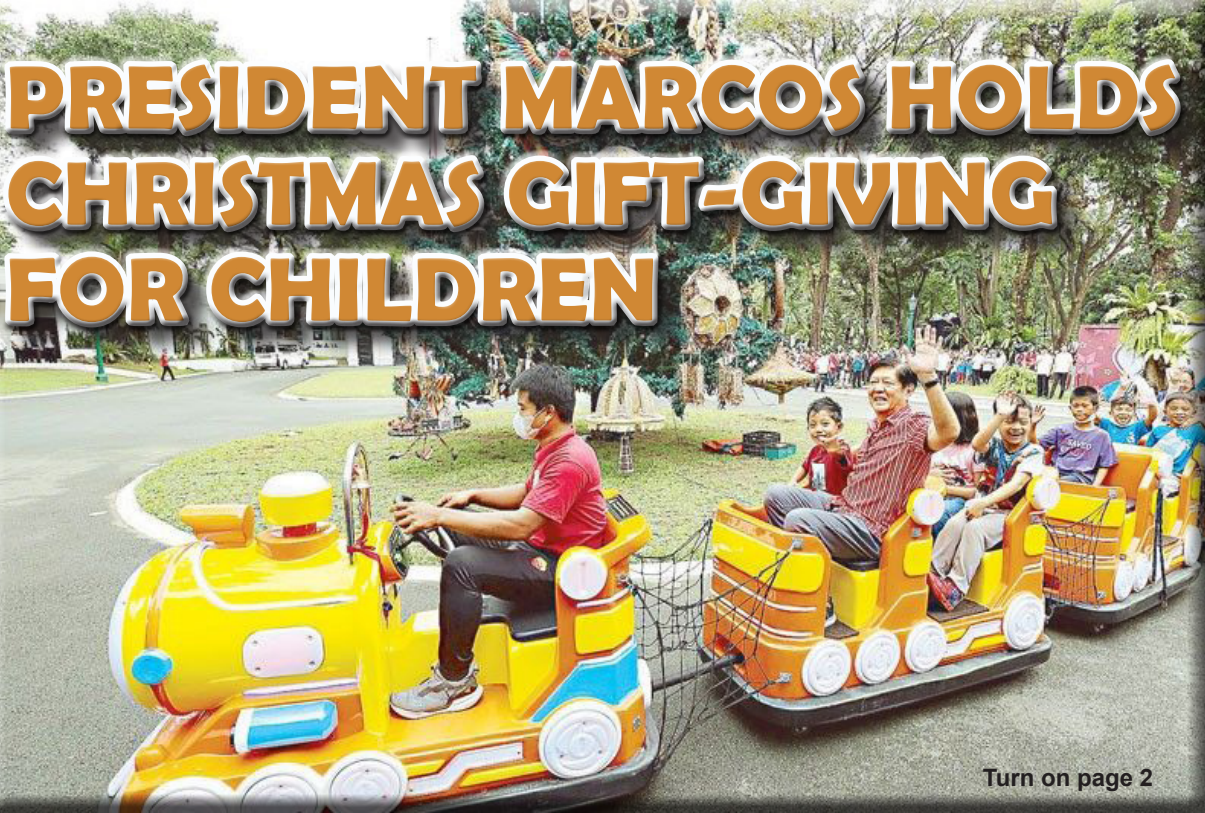
Turn on page 2

MANILA, Philippines — President Marcos joined over 17,000 children from selected shelters and orphanages around the country for the second Christmas gift-giving day at Malacañang yesterday. In his speech, Marcos recalled that his late father and namesake also had similar Christmas gatherings for children at the Palace during his presidency. "You know, when I was your age, my father was the president. So, every Christmas this is what we do here. Now, of course we are high-tech, we're not only having a merry Christmas and gift-giving here at the Palace, but in different places in the Philippines so that all our children can feel Christmas," the President told over 1,700 children at Malacañang in Filipino. ADVERTISING "We all know that Christmas is really about the children. And we always have a merry Christmas when the children have a good Christmas," he said. "That's really what the Christmas spirit