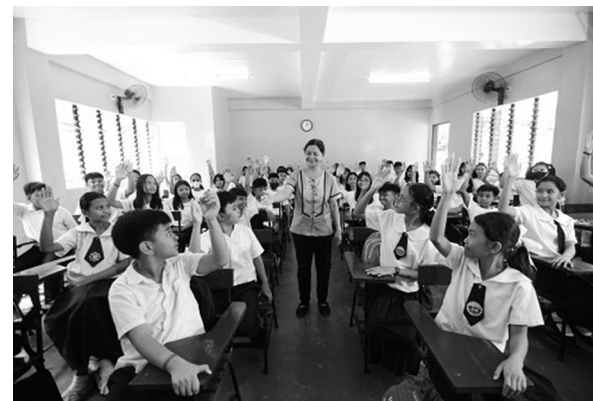
Inside one of the newly built classrooms donated by SM Prime Holding, Inc. (SMPHI), through SM Foundation.

SM Foundation turns over new school building in Batangas