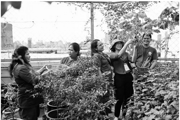
Some of the KSK farmers in Manila harvest the vegetables in SM City San Lazaro's urban garden.

SM Foundation marks graduation of Urban Gardeners