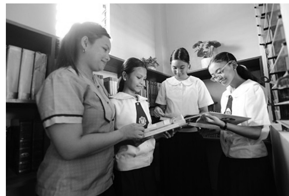
SM Foundation installed a reading corner to help encourage learning and interest in reading among SAES students.

Promoting inclusivity, the building is equipped with PWD-friendly facilities—from ramps to accessible restrooms with handrails. SM Foundation also set up a reading nook in an area with high student traffic to encourage learning.