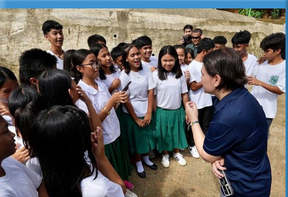
Turn on page 3