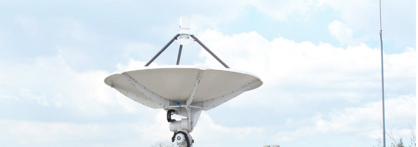
A satellite Ground Receiving Station (GRS) facility in Quezon City.

"ATMO and the Department of Science and Technology's (DOST) partnership on an AI-powered weather forecasting system will help the Philippines build its climate resilience," Marcos said.