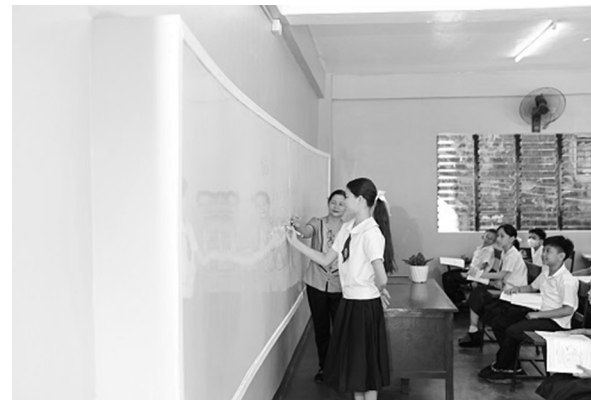
Students of SAES begin using the new facilities and learning equipment, including a concave whiteboard.

As an active partner of the Department of Education's Adopt-A-School Program, SM Foundation turned over a two-floor, four-classroom school building to SAES. Each of the classrooms is well-equipped with armchairs, including left-handed ones, wall fans, and concave whiteboards.