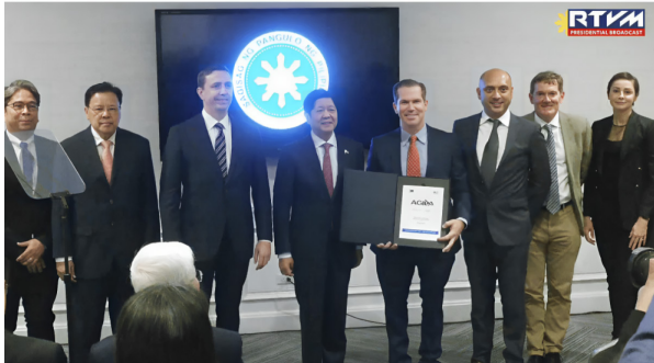
President Ferdinand R. Marcos, Jr. poses for a photo after witnessing the agreement signing between Philippine firm Orbits Corp. and California's Astranis Space Technologies in San Francisco in the United States.

President Ferdinand R. Marcos, Jr. witnessed the signing of a landmark collaboration, $400 million agreement between Philippine firm Orbits Corp. and California's Astranis Space Technologies during his visit to San Francisco, USA.