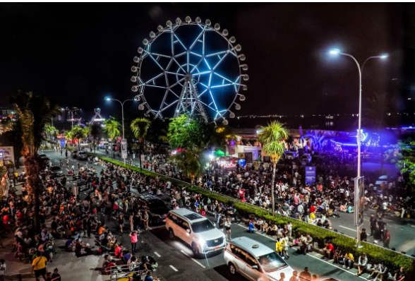
Thousands converge on SM by the BAY last year, creating a sea of faces captivated by the breathtaking pyrotechnic display that unfolds against the stunning backdrop.

As the longest-running pyrotechnic competition in the Philippines, the PIPC has earned its reputation as a premier event that mesmerizes audiences from around the globe. This year, eight of the world's top pyrotechnic teams, including reigning champions, will dazzle spectators with their explosive artistry in a bid to claim the coveted title of pyro supremacy.