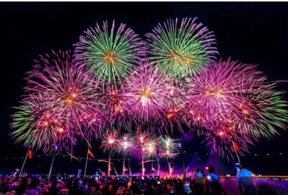
The highly anticipated 12th Philippine International Pyromusical Competition ignites once more, dazzling spectators at SM by the BAY on February 15, 2025.

he night sky over SM Mall of Asia (MOA) is set to come alive with breathtaking colors and music as the 12th Philippine International Pyromusical Competition (PIPC) takes center stage at the iconic Seaside Boulevard starting February 15, 2025.