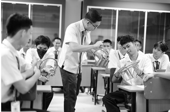
A dedicated teacher from PSD provides a hands-on lecture inside their newly rehabilitated school building

A school renovation project amplifies the potential of deaf community