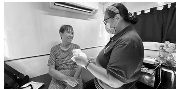
The SM Foundation sends its mobile clinic to the medical missions to extend free ECGs and X-Rays.