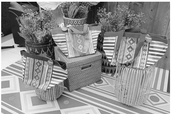
The bags were cut and cleaned by persons deprived of liberty (PDL) from Quezon City and were assembled by Filipino artisans from Bulacan.

The social good collaboration collects, repurposes, and transforms used tarpaulins from SM Stores into stylish and sustainable bags and pouches, with proceeds donated to SM Foundation's School Building and Health and Medical programs.