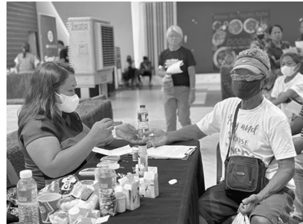
An elderly patient avails of free medical services at SM City Marilao's SM Foundation medical mission.

Social good initiatives like medical mission's uplift populations who put healthcare last and prioritize more immediate concerns like securing food and shelter. These missions bring essential healthcare services directly to vulnerable populations to alleviate immediate health concerns and promote long-term well-being and empowerment.