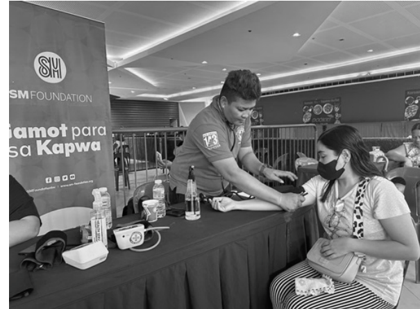
Social good collaboration for healthcare. Joining the medical missions were volunteers and partners from Krus na Ligas Elementary School alumni group, Health Departments of Marilao and Quezon City, Willore Pharmaceutical, Marilao and Krus na Ligas LGUs, Batangas Medical Center, Batangas and Bulacan Chapters of Philippine Red Cross, GX International, and MX3 - DMI Medical Supplies.

As it continues to promote healthcare in various communities, SM Foundation recently held three successful medical missions in Brgy. Krus na Ligas, Quezon City, SM Center Batangas, and SM City Marilao, Bulacan. A dedicated team of healthcare professionals and volunteers joined to provide free medical and dental services, as well as free medicines, to the local communities. With over 1,900 patients receiving much-needed medical attention and treatment.