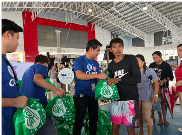
SM City Bataan employee volunteers lead the distribution of 300 Kalinga Packs to the families affected by the oil spill in Bataan.

SM Foundation, in partnership with employee volunteers from SM City Bataan, distributed 300 Kalinga packs on August 9 to families affected by an oil spill in Barangay Lamao, Limay, Bataan.