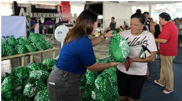
A resident affected by the oil spill in Limay, Bataan receives a Kalinga Pack from a volunteer in SM City Bataan.

SM Foundation, in partnership with employee volunteers from SM City Bataan, distributed 300 Kalinga packs on August 9 to families affected by an oil spill in Barangay Lamao, Limay, Bataan.