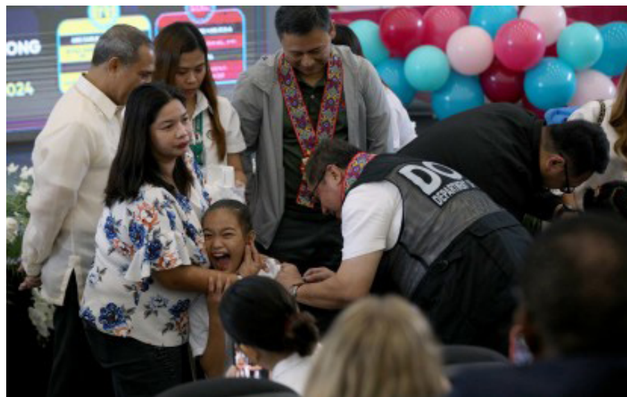
PREVENTION. Health Secretary Teodoro Herbosa administers vaccine on a student of Dr. A. Albert Elementary School in Sampaloc, Manila on Monday (Oct. 7, 2024) as Education Secretary Sonny Angara (center) looks on. The "Bakuna Eskwela" (School Vaccination) program provides protection to school-aged children against measles, rubella, diphtheria and for girls, human papilloma virus.

Meanwhile, Education Secretary Sonny Angara assured that the DepEd will conduct an intensified information campaign to reduce vaccine hesitancy among learners in the basic education sector.