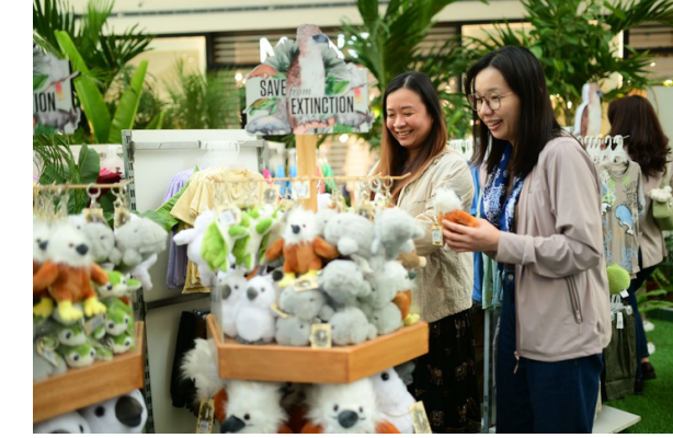
Join the fight to save wildlife by purchasing your own “Save from Extinction” merchandise.

In addition to the merchandise, Banco De Oro (BDO) Unibank, Inc., a key partner in the campaign, is offering donation channels to make it even easier for the public to contribute. The public can easily make donations through BDO ATMs and branches nationwide, as well as through the BDO Online app. All collected funds will go to the partner NGOs dedicated to the conservation of these species.