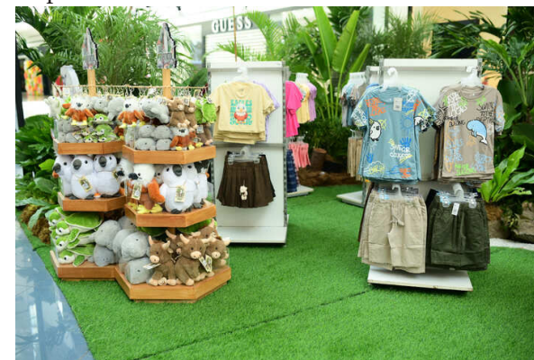
Support the cause to save wildlife in style.

But there is more to this exciting campaign than cuddly toys from Toy Kingdom. SM has expanded its offerings to include chic new shirt designs from Kultura and a children’s apparel line from SM Fashion, inviting everyone—from eco-conscious advocates to young animal enthusiasts—to support the cause in style.