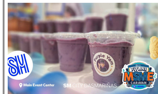
The Viyline Micro, Small, and Medium Enterprises (MSME) Caravan at SM Supermalls highlights a diverse array of shopping delights.

As the movement gains nationwide traction, here are the next scheduled stops of the Viyline MSME Caravan: SM City Fairview – June 18 to 24 SM City Cabanatuan – July 16 to 22 SM City Davao – August 23 to 29