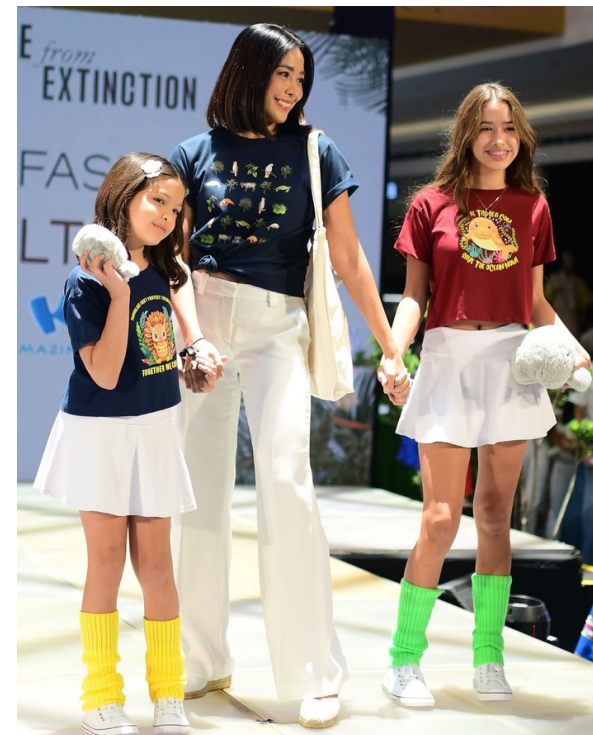
Fashion statements for wildlife conservation.

SM is amplifying its commitment to wildlife conservation with the launch of a captivating new merchandise line dedicated to six of the Philippines’ most endangered species.