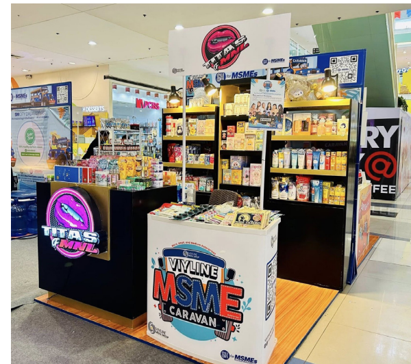
The Viyline Micro, Small, and Medium Enterprises (MSME) Caravan brings local brands and passionate entrepreneurs together, such as during their stop at SM City Dasmariñas last April.