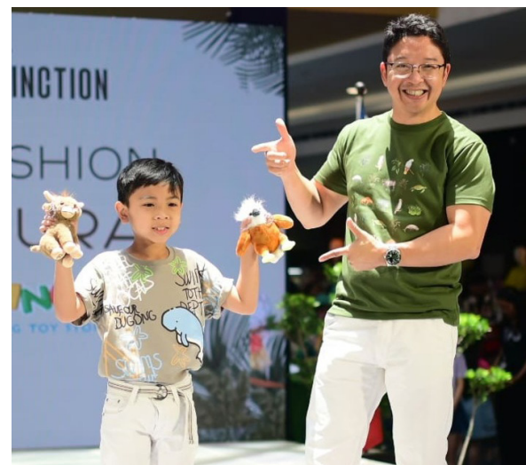
Fit check with a cause: Save from Extinction new shirt designs for adults and kids.

But there is more to this exciting campaign than cuddly toys from Toy Kingdom. SM has expanded its offerings to include chic new shirt designs from Kultura and a children’s apparel line from SM Fashion, inviting everyone—from eco-conscious advocates to young animal enthusiasts—to support the cause in style.