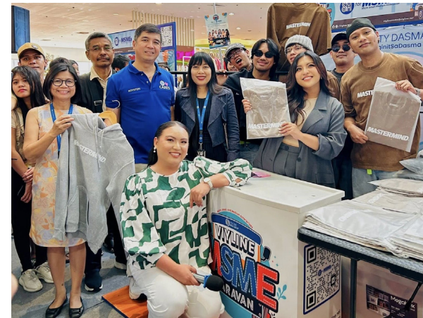
Driven by influencer Viy Cortez (second from right), the Viyline Micro, Small, and Medium Enterprises (MSME) Caravan empowers homegrown businesses, showcasing Filipino creativity and resilience nationwide.

Following a string of successful runs in SM City Bataan, SM City Baguio, SM City San Pablo, and SM City Dasmariñas, the Viyline Micro, Small and Medium Enterprises (MSME) Caravan is all set to bring its next wave of entrepreneurial energy to SM City Santa Rosa from May 21 to 27, 2025.