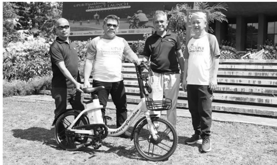
A total of 120 units of e-bikes and electric kick scooters have been distributed in 22 stations within the campus which can be utilized by the public to meet public transportation needs inside the university.

To revive the bicycle culture, reduce carbon footprints, promote a healthy lifestyle, and provide a convenient mode of transportation within the campus, the University of the Philippines Los Baños (UPLB) officially launched its Tipaklong Mobility Sharing Project as part of the celebration of Philippine Environment Month. Through this initiative, students, faculty, staff, and the interested public can now become Tipaklong hoppers and conveniently roam the campus in an enjoyable, efficient, and