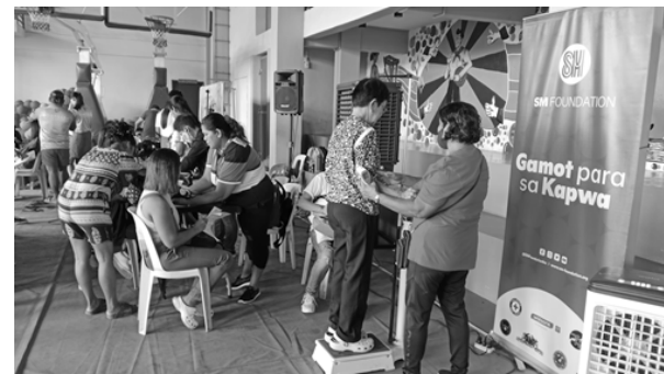
Medical mission in Looc, Batangas

SM Foundation, the social good arm of the SM Group, recently conducted two successful medical missions in the municipalities of Looc and Ibaan, Batangas. The initiative, which aimed to provide accessible healthcare services to vulnerable communities, served approximately 700 patients. During the two-day event, residents of Looc and Ibaan received a wide range of free healthcare services. These included medical and dental check-ups, X-rays, and electrocardiogram (ECG) tests performed inside SM Foundation's state-of-the-art mobile clinic. Additionally, patients underwent blood chemistry tests, as well as screenings for sugar, cholesterol, uric acid, and hemoglobin levels.