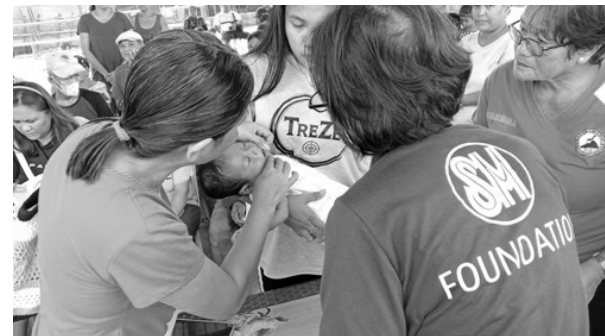
An SM Foundation volunteer doctor attends to one of the patients during the medical mission in Ibaan.

SM Foundation, the social good arm of the SM Group, recently conducted two successful medical missions in the municipalities of Looc and Ibaan, Batangas. The initiative, which aimed to provide accessible healthcare services to vulnerable communities, served approximately 700 patients. During the two-day event, residents of Looc and Ibaan received a wide range of free healthcare services. These included medical and dental check-ups, X-rays, and electrocardiogram (ECG) tests performed inside SM Foundation's state-of-the-art mobile clinic. Additionally, patients underwent blood chemistry tests, as well as screenings for sugar, cholesterol, uric acid, and hemoglobin levels.