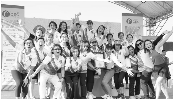
The 2024 Filipina CEO Circle Women's Run PH honors female triumph and impact.

Committed to championing Filipina business leaders, the FCC collaborated with Women's Run PH and SM Supermalls to ignite women's inspiration through running, emphasizing their unified strength and amplifying their successes. /PR