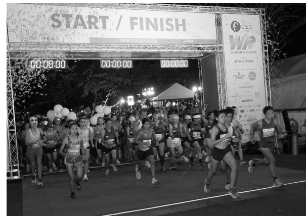
Participants in the 10K race category pound the pavement with perseverance and endurance.

SM Supermalls and the Filipina CEO Circle (FCC) successfully hosted the Women's Run PH at SM By the Bay on March 10, 2024, highlighting a triumphant return for the event during International Women's Month in March.