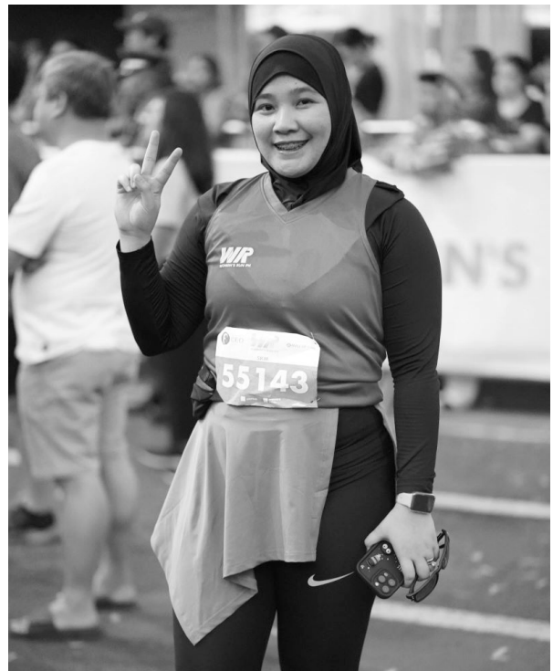
The Women's Run breaks barriers with the power of inclusion.

The success of the Women's Run PH at SM By the Bay underscores the growing importance of women's health and fitness initiatives. The event not only promoted physical well-being but also fostered a sense of community and unlocked potential among Filipina participants.