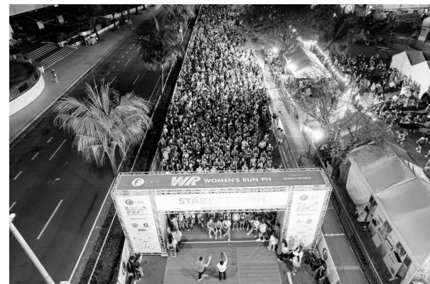
Runners unite for the empowering Women's Run.

Thousands of women, from seasoned runners to enthusiastic novices, participated in the various race categories, including a 1KM Kids Dash, a 5KM Women's Run, a 10KM Women's Run, and a 10KM Buddy Run for male-female pairs.