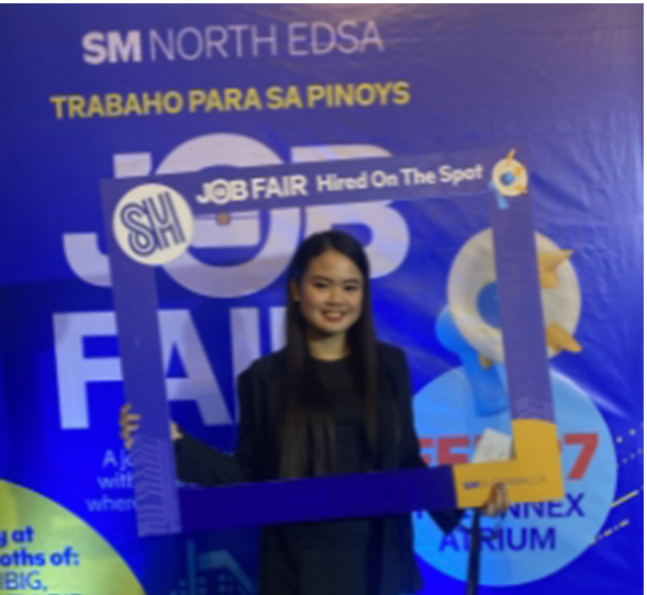
An applicant gets hired-on-the-spot during the SM Supermalls Job Fair.

In celebration of Labor Day, SM Supermalls reaffirms its dedication to supporting Filipino job seekers by providing accessible employment opportunities through strategic partnerships and nationwide job fairs. As part of this commitment, SM is renewing its collaboration with Jobstreet by SEEK to enhance job matching, ensuring that more Filipinos find meaningful careers.