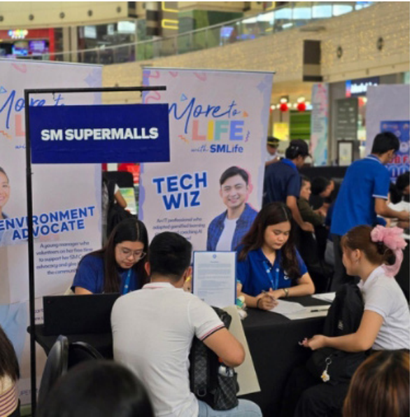
Job seekers explore career opportunities at the SM Supermalls Job Fair at SM North EDSA.

Renewing our partnership with Jobstreet by SEEK Building on past successes, SM will renew its partnership with Jobstreet by SEEK on May 1, reinforcing its commitment to connecting job seekers with top employers. This continued collaboration enhances digital and on-site recruitment efforts, ensuring a seamless job search experience.