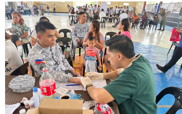
Philippine Navy personnel, their families, and nearby residents receive medical services during the mission at Naval Station Central Visayas.