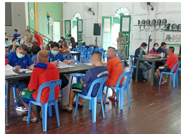
Volunteers and social good partners provide care for persons deprived of liberty (PDLs) Iwahig Prison and Penal Farm in Puerto Princesa.