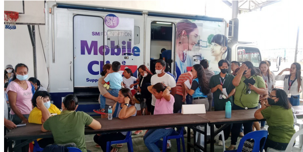
In Dumaguete City, beneficiaries line up at the SM Foundation mobile clinic to receive free X-rays and ECG services.

SM Foundation is continuing its long-running effort to bring healthcare services to communities with limited healthcare access. Its Medical Mission program began in 2001 and has since conducted more than 1,700 medical missions, reaching over 1.3 million patients across the country. Carried out with the help of various social good partners, the initiative has adapted over time to address the needs of its beneficiaries. A mobile clinic has been supporting the missions, equipped with X-ray and ECG machines, as well as blood and urine analyzers for on-site diagnosis and treatment. In recent weeks, the foundation has brought its services to multiple locations. These included SM City Puerto Princesa Brgy. Salvacion and Iwahig Prison and Penal Farm in Puerto Princesa, Dumaguete City, and Valencia in Negros Oriental, San Remio, Bogo, and Naval Station Central Visayas in Cebu. Over a thousand patients in the said areas received consultations, diagnostic services, and basic medical care. SM Foundation is set to conduct more medical missions in the coming months. These activities will run alongside its Wellness Center program, which involves the re-vamp and rehabilitation of health centers and hospitals to improve healthcare delivery. /PR