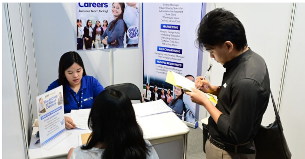
A job searcher engages with recruiters at the May 1 SM Labor Day Job Fair at the SMX Convention Center Manila, seeking new career prospects.

Looking for your next big move? SM Supermalls, together with SM Retail, invites jobseekers to the SM Group Job Fair happening this May 29, 2025 (Thursday) at the Main Event Center, SM City Dasmariñas.