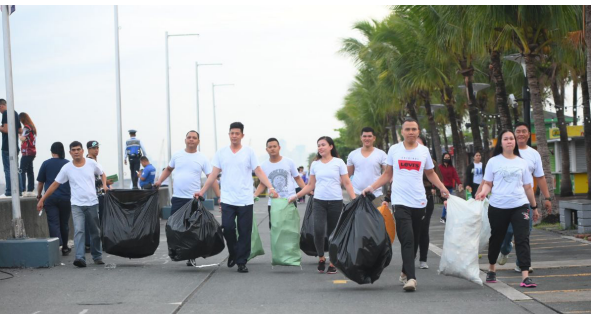
Employees carry sacks of collected waste during a coastal cleanup activity, underscoring their active role in advancing environmental protection through the company's coastal cleanup initiative.