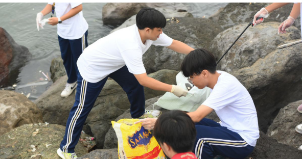
Students from NU Nazareth School take action for a cleaner coastline during coastal cleanup drive at SM by the Bay.

Held simultaneously in multiple coastal locations nationwide, the initiative is organized in partnership with local government units, environmental organizations, NGOs, community groups, SM employees, security and janitorial personnel, and affiliates. It is part of SM's broader environmental commitment through the #SM-WasteFreeFuture campaign, which also includes year-round plastic waste reduction efforts, recycling markets, and e-waste disposal drives.