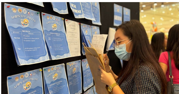
The SM Group Job Fair brings a wide range of career opportunities to jobseekers.

Whether you're into fashion, food, banking, retail, or anything in between—there's something for everyone. This special job fair gathers powerhouse brands from the SM Group across retail, logistics, real estate, banking, and more—making it a true one-stop shop for career opportunities.