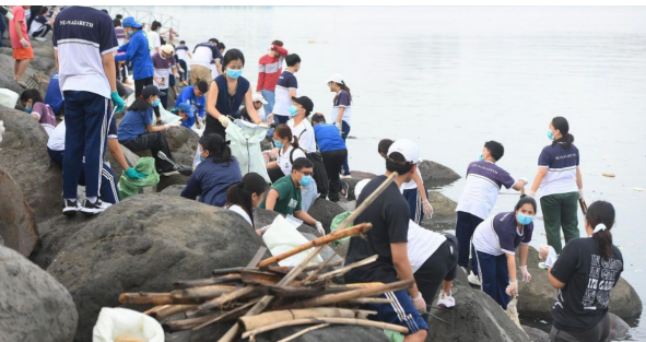
Students actively participate in coastal cleanup drive, reinforcing their role as environmental stewards and contributing to the preservation of marine ecosystems.

In celebration of World Oceans Day 2025, SM Cares, the corporate social responsibility arm of SM Supermalls, will once again mobilize thousands of volunteers across the country for its annual Coastal Cleanup Drive, set for June 7, 2025. This year's theme, “WONDER: Sustaining What Sustains Us,” serves as a powerful reminder of the oceans' role in supporting life—and our shared responsibility to protect them.