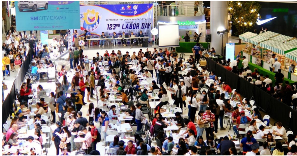
A bustling Labor Day job fair organized by SM fills SM City Davao, connecting numerous applicants with potential employers.

Recruiters will be conducting on-the-spot interviews with the possibility of same-day hiring. Key government agencies such as Social Security System, Pag-IBIG, and PhilHealth will also be present to process or update employment requirements—making the job application process faster, easier, and more convenient.