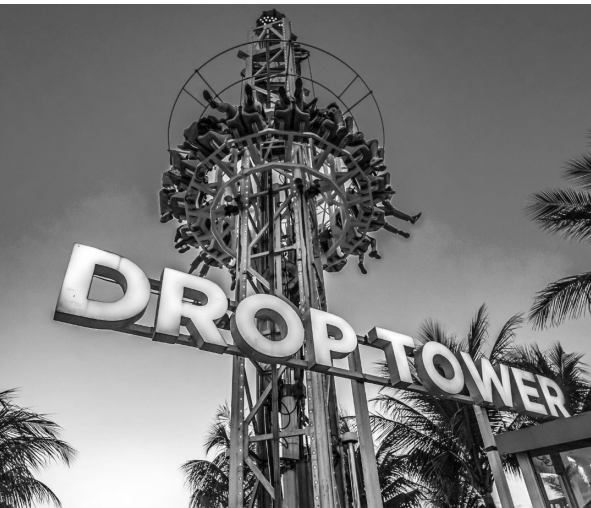
Defy gravity and unleash your inner thrill-seeker on the Drop Tower ride.

DROP TOWER: Experience the thrill of gravity at the Drop Tower ride! This heart-racing ride towers 40 feet high, lifting passengers to the top before releasing them to free fall, intensifying the excitement. Let this exhilarating experience, for only 120php, make you scream your heartache away.