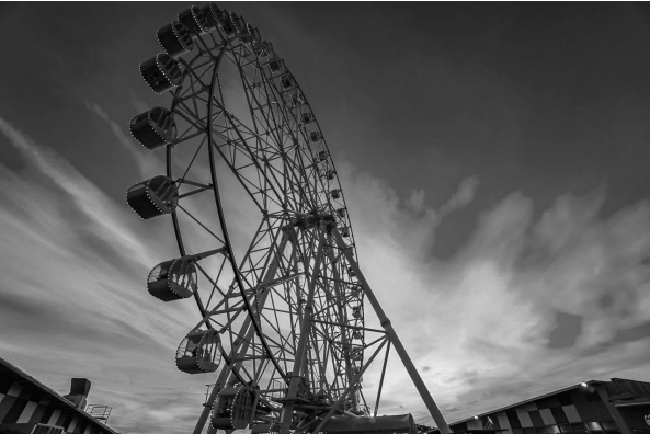
Treat your special someone to a V-Day ride on the MOA Eye and soak in the breathtaking views.

Get VIP gondola tickets for only 250php, while regular tickets are priced at 200php