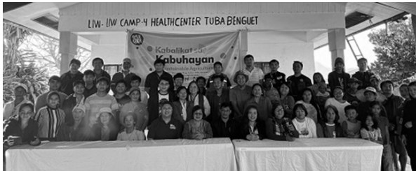
Ang paglulunsad ng KSK sa Sitio Liw-liw, Tuba, Benguet

Sa layuning mapalakas ang sektor ng agrikultura sa bansa, muling naglunsad ang SM Foundation ng kanilang programang Kabalik at sa Kabuhayan.