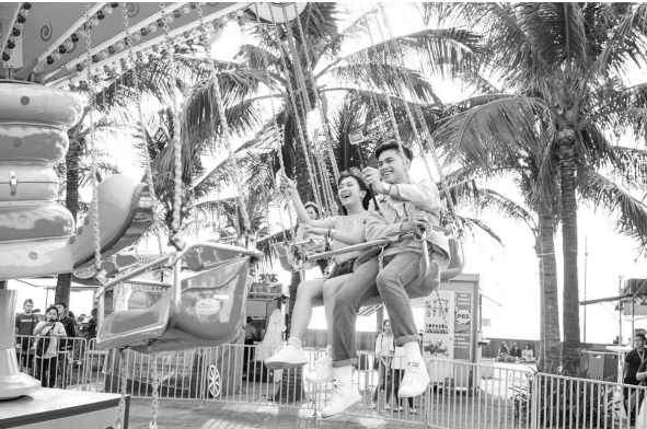
Go on an adventure with loved ones aboard the Lolly Swing ride.

LOLLY SWING. Have fun with your family, friends, and special someone on the Lolly Swing ride. This colorful, candy-themed ride features a unique swing with a bucket seat, providing a sweet ride as it rotates, raises you in the air, and swings. Enjoy a ride on the Lolly Swing for only 60php.