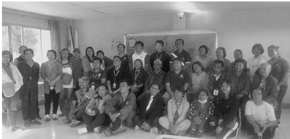
Ang mga kalahok ng KSK training sa Happy Hollow, Baguio City

Sa pamamagitan ng proyektong ito, layon ng SM Foundation na bigyang bagong sigla ang sektor ng agrikultura sa pamamagitan ng pagpapalakas at pagtuturo ng karagdagang kaalaman tungkol sa mga modernong teknolohiya, pagne-negosyo, at iba't iba pang aspeto ng pagsasaka.