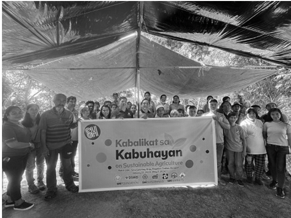
Brgy. Bayabos, Sablan Benguet

Simula ng ilunsad ni Henry "Tatang" Sy, Sr. noong 2008, mahigit 28,000 na magsasaka na ang naka-pagtapos sa nasabing programa.