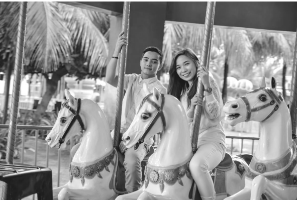
Take a spin on the Grand Carousel and let love whisk you and your loved ones away this Valentine's Day!

CAROUSEL. Experience the magic of the Grand Carousel ride, perfect for kids and kids-at-heart. For only 60php, create fairy-tale memories as you enjoy the charm of riding a genuine antique horse on this classic and timeless ride. It's a truly romantic ride that delights the heart.