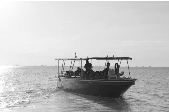
Cruise Manila Bay at sunset, creating unforgettable memories with loved ones.

CRUISE BY THE BAY. Witness the breathtaking sunset and city lights at night as you cruise along Manila Bay with your special someone, friends, or family. Fall in love with the unobstructed Manila skyline view while feeling the cool breeze against your skin. Tickets for the boat ride are priced at 200php for a 30-minute ride.