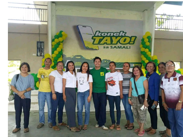
CARD Bank clients took part in the konekTAYO event in Samal, along with the konek2CARD brand ambassador, Mr. JC Santos.

On April 18, 2026, the first konekTAYO 2026, attended by 462 CARD Bank clients, was held at the New Kaputian Gymnasium, Purok Tower, Poblacion Kaputian, Samal, Davao del Norte.