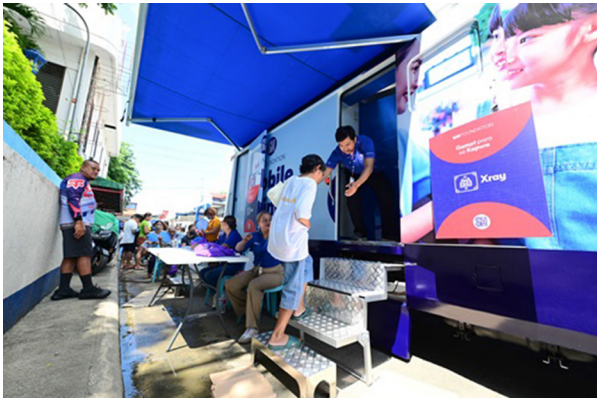
The medical mission features the new mobile clinic, making free healthcare service more accessible and comfortable for patients.

tained efforts in community health outreach. The recent medical mission was capped successfully with its social good partners Taytay LGU, DSWDm, Region 4A-Willore Pharmaceutical, and MX3 Natural Supplements.