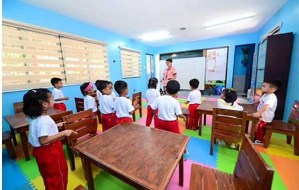
A teacher at Praise Kids Day Care Center facilitates an educational activity inside the newly renovated classroom.

SM Foundation continues to strengthen its commitment to education as it turned over five newly refurbished day care centers in Nasugbu, Batangas. In collaboration with Manila Southcoast Development Corporation (MSDC), the newly renovated facilities include Praise Kids Day Care Center, Lucky Angel Day Care Center, Holy Child 1 Day Care Center, Shining Glory 1, and the multipurpose Shining Glory 2 Day Care Center. By investing in early childhood education, the SM Foundation aims to provide a strong educational foundation for young learners, setting them on a