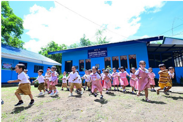
Pupils prepare for an activity in front of the new Shining Glory 1 Day Care Center

SM Foundation continues to strengthen its commitment to education as it turned over five newly refurbished day care centers in Nasugbu, Batangas. In collaboration with Manila Southcoast Development Corporation (MSDC), the newly renovated facilities include Praise Kids Day Care Center, Lucky Angel Day Care Center, Holy Child 1 Day Care Center, Shining Glory 1, and the multipurpose Shining Glory 2 Day Care Center. By investing in early childhood education, the SM Foundation aims to provide a strong educational foundation for young learners, setting them on a