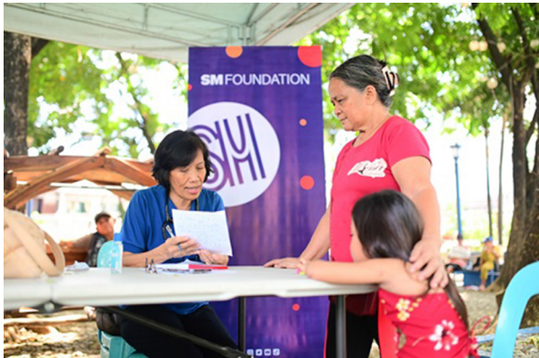
The medical mission provided over 800 medical services with the help of volunteer healthcare professionals and SM City Taytay employees.