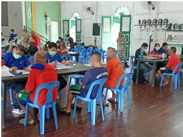
Volunteers and social good partners provide care for persons deprived of liberty (PDLs) Iwahig Prison and Penal Farm in Puerto Princesa.