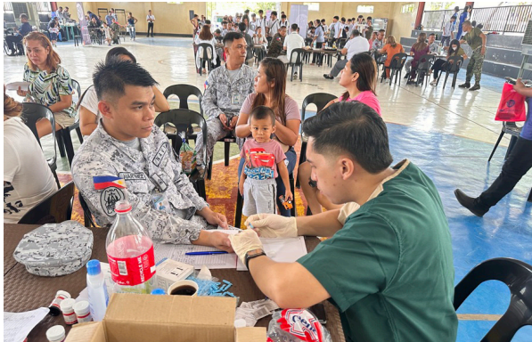
Philippine Navy personnel, their families, and nearby residents receive medical services during the mission at Naval Station Central Visayas.