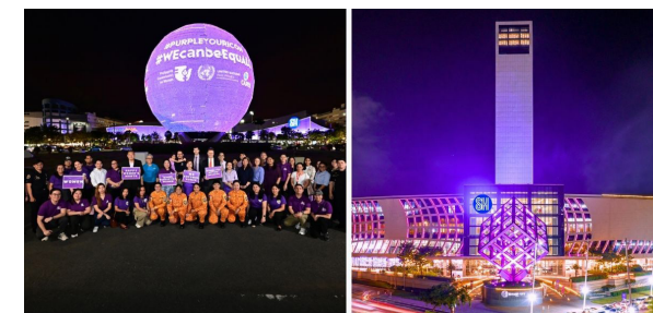
Purple illumination signals start of Women's Month