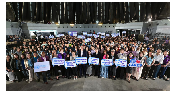
Young leaders, advocates, and partners gather at the SM North EDSA Skydome for "Youth Rising: Rights. Justice. Action. For ALL Women and Girls," the centerpiece of SM Cares' Women's Month 2026—uniting 47 youth groups and schools to advance action on gender equality, climate justice, sexual and reproductive health and rights, and gender-based violence prevention.

In line with the theme "Rights. Justice. Action. For ALL Women and Girls" SM Supermalls celebrated Women's Month 2026 through a series of collaborative initiatives that sought to elevate conversations on matters that affect women into meaningful actions.