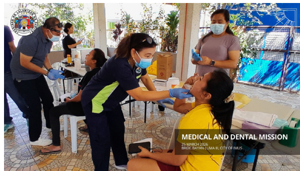
MEDICAL AND DENTAL MISSION 25 MARCH 2026 BAYAN LUMA III, BACOR CITY

The outreach program provided free medical consultations and check-ups to 423 residents, with healthcare professionals attending to a variety of health concerns and offering basic medical services.