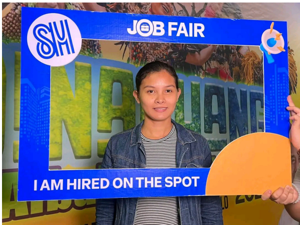
A successful hired-on-the-spot candidate at the SM Job Fair is ready to start their new career.

Companies are looking for a broad range of talents, from entry-level positions like cashiers and assistants to managerial roles in fields like accounting, retail, and information technology (IT).