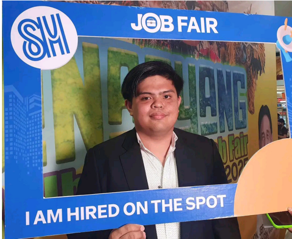
A hired-on-the-spot applicant celebrates landing their new job at the SM Job Fair.