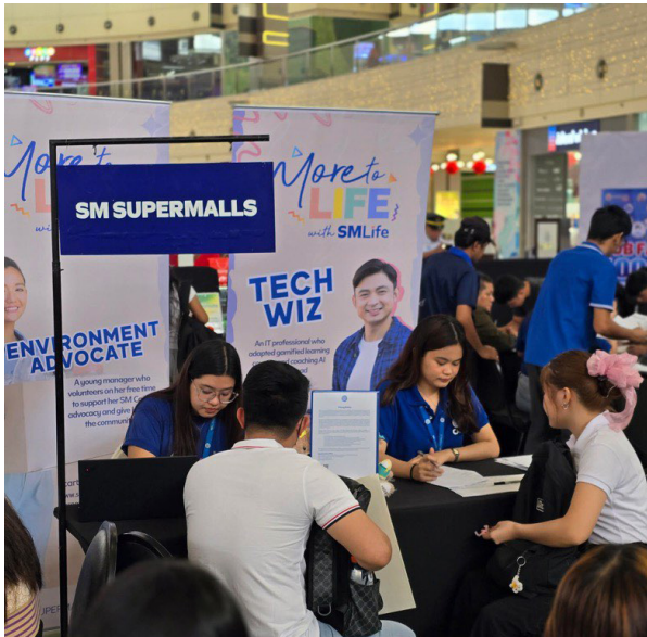
The SM Job Fair creates a dynamic space where potential talent meets opportunity.

On-the-spot hiring: Immediate interviews with hiring managers increase applicants' chances of landing a job offer right away. Enhanced application support: Applicants may find on-site government booths that processes essential employment documents, which may include National Bureau of Investigation Clearance, National ID, Social Security System, PhilHealth, Pag-IBIG, and Taxpayer Identification Number verification. Job-seeker friendly location: Easy access to public transportation and highly visible areas inside the mall. Comfortable spaces: Enclosed, well-ventilated venues with on-site amenities, where applicants enjoyed the convenience of having food options and shopping for professional attire.