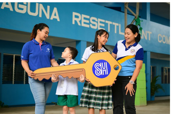
SM Prime and SM Foundation turns over the new school building in LRCS, helping the students receive adequate learning time necessary for a more comprehensive education.

"Through their programs, they are making a difference in the lives of every Filipino learner, especially here in LRCS. Having this building helps nurture better individuals as they see that they belong to a community that genuinely cares for them. Initiatives like this help them learn about civic responsibility. When learners achieve their goals in the future, they will remember the value of giving back to the community," she added.