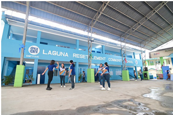
The new two-floor school building of Laguna Resettlement Community School features four fully equipped rooms with PWD-friendly facilities.

Overcrowded classrooms, insufficient learning time, inadequately designed learning spaces, and teacher dissatisfaction pose challenges to the Philippine education system. The challenges faced by the Philippine education system are multifaceted. With inadequate time for instruction, students are unable to grasp concepts thoroughly, leading to a compromised educational experience. Non-conducive learning environments contribute to an atmosphere that hampers intellectual growth. These challenges not only impact students' academic performance but also the job satisfaction of teachers, who navigate these obstacles daily. Believing in the power of education, the SM group, through the collaboration of SM Prime and SM Foundation, continuously builds school buildings to help address the challenges faced by the education system in the Philippines. A testament to this is the school building they recently built at the Laguna Resettlement Community School (LRCS).