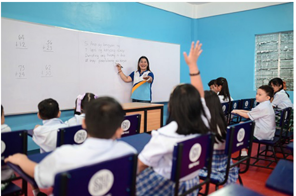
LRCS ends the class shifting for second grade, providing pupils ample time for learning activities and helping enable job satisfaction among teachers.

By providing spacious and well-equipped facilities, students now have room for growth, fostering an environment conducive to effective learning. The expansion of school infrastructures has allowed LRCS to end class shifts in second grade, ensuring that students receive the adequate learning time necessary for a more comprehensive education.