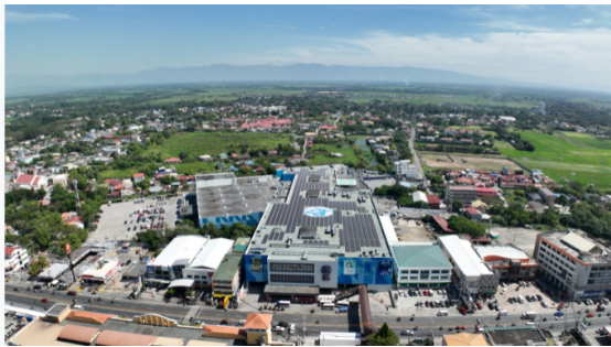
SM City Urdaneta Central in Pangasinan powers its operations with a 0.89MWp solar energy system, fully operational in 2023.

This 51.6 MW capacity significantly cuts carbon emissions, providing clean energy that powers thousands of homes or removes thousands of cars from the roads. It also reduces the need for coal, offering environmental benefits for both the planet and local communities.