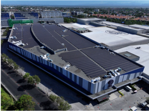
SM City Santa Rosa adopts a 3.17MWp solar energy system in 2023, reinforcing its commitment to clean energy.

Today, SM Supermalls operates 44 malls with solar PV systems, generating a combined peak energy of 51.6 megawatts (MW). The largest installation is at SM City Santa Rosa. With a total of 96,000 solar panels across malls in Luzon and Visayas, SM Prime holds the Philippines' largest solar energy portfolio, covering around 33 hectares. These efforts are a vital part of the company's Net Zero by 2040 strategy, aimed at reducing its carbon footprint.