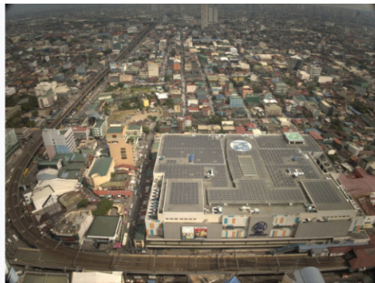
In 2023, SM City Grand Central in Caloocan activates a 1.6MWp solar energy system, enhancing its sustainability efforts.