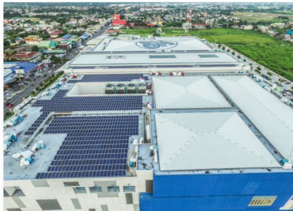
SM City Cabanatuan harnesses the power of the sun with a 0.413MWp solar energy system, powering the mall with clean energy.

The solar power generated directly fuels essential mall operations like lighting and escalators, reducing SM Supermalls' reliance on the national grid. This, in turn, helps stabilize the power supply, reducing the risk of outages and easing the burden on electricity providers. By tapping into clean, renewable energy, SM Prime is contributing to a more sustainable future for the Philippines.