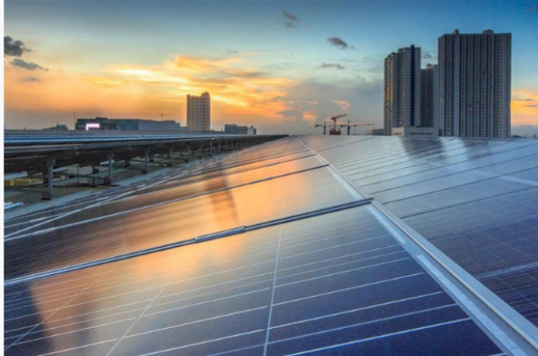
SM North EDSA is operational with a 1.5MWp solar energy system since 2014.

Imagine a world powered by the sun, the ultimate source of life. As climate change worsens due to fossil fuel use, sustainable energy alternatives are more crucial than ever. The Philippines, with its abundant sunlight, is uniquely positioned to harness solar power and help combat climate change. In 2024, Manila experienced around 4,440 hours of daylight, which translates to a significant potential for solar energy production.