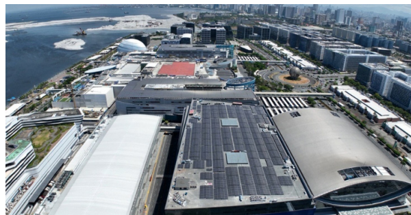
M Mall of Asia (MOA) Square boasts a 2MWp solar energy system, reducing its environmental impact and contributing to a greener future.

Solar power directly fuels key mall operations, including lighting and escalators, minimizing SM Supermalls' dependence on the national grid.