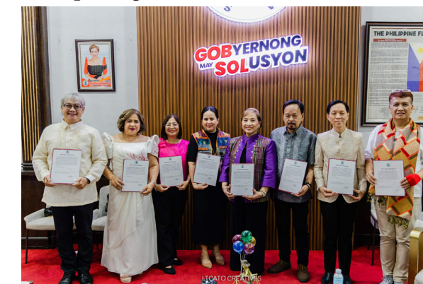
Laguna Tourism Council Officers

Mrs. Mamon was also reelected as the president of the Laguna Tourism Council (LTC), officially assuming the new term together with the other newly elected LTC officers during the oath taking ceremony administered by Governor Sol Aragoness last January 22 in Santa Cruz, Laguna. LTC is a provincial multi-sectoral body composed of representatives from various government and