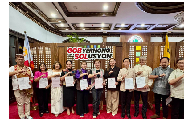
Induction of Officers of Laguna Tourism Council

Celebrating its 50th anniversary, LCCI is a non-stock, non-profit, non-government organization, comprised of Laguna-based small, medium, and large enterprises, dedicated to foster a stronger, sustainable local economy, and promote growth, resilience and competitiveness of the business community in the province.