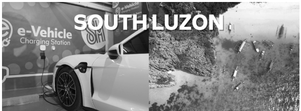
Heading down South? Enjoy mountain views and beachfronts all the way until Bicol and recharge at any of these Electric Vehicle Charging Stations at SM malls.

Experience the laid-back vibe of La Union, known for its surf-worthy waves, golden beaches, and breathtaking sunsets. Kick off your journey from Metro Manila and recharge your EV at SM North EDSA before heading towards La Union to ride the waves and get some locally brewed craft beer or handmade woven accessories. As you drive along the scenic coastal roads, recharge your vehicle at SM Tarlac or SM Urdaneta Central. With SM Supermalls' EVCS branches conveniently located, including SM Baguio, you can enjoy endless hours of surfing, beach hopping, and sunset watching in La Union.