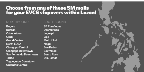
#ReChargeWithSM and enjoy your Luzon road trip worry-free at SM Supermalls.

As the Holy Week approaches, many Filipinos are gearing up for a well-deserved break, seeking the perfect blend of relaxation and adventure. Whether you're planning a road trip up north or a leisurely drive down south, you can #ReChargeWithSM through an extensive network of FREE Electric Vehicle Charging Stations (EVCS) at 50 SM malls around the Philippines, ensuring your journey is smooth, convenient, and eco-friendly.