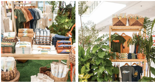
Kultura's exclusive merchandise collection for Save From Extinction features artwork of the dugong, pangolin, pawikan, tamaraw, cockatoo, and Philippine eagle on t-shirts and tote bags.

chandise from Kultura, with proceeds supporting conservation efforts. Kultura's merchandise lineup includes t-shirt designs for both adults and children in several colors, with each product highlighting one of the six endangered animals. Canvas tote bags featuring the animals are also available for purchase.