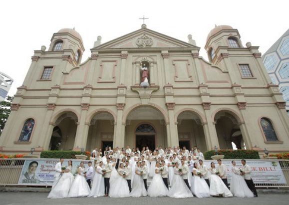
Thirty-six couples, who are SM Group employees, exchanged vows during the ninth Kasalan sa SM held at the Archdiocesan Shrine of Jesus - the Way, the Truth, and the Life.