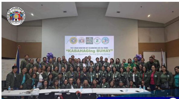
Post World Organ Donation Day

The Office of the Provincial Health Officer (OPHO) organized the Post World Organ Donation Day event with the theme, "Kabahaging BUHAY: Kabitenyo Bayanihan, Handog Gintong Buhay," held on October 16, 2024, at the Cavite Collaboration Center for Public Health. This initiative aimed to raise awareness about the Department of Health's (DOH) organ donation program, encouraging more Caviteños to become life-saving donors.