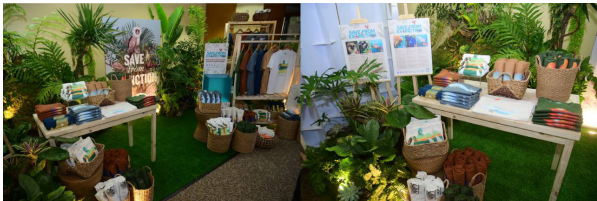
Exclusive shirts and totes by Kultura at the 'Save from Extinction' booth invite shoppers to join the movement to safeguard the Philippines' most endangered wildlife. A portion of proceeds will go towards supporting this conservation initiative.